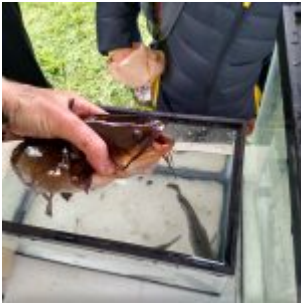
EnviroScience was a sponsor and supporter for the 2017 National Parks Bioblitz