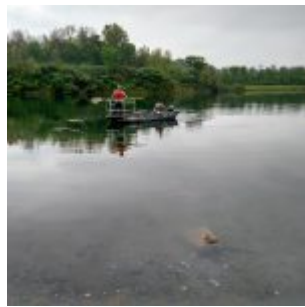
EnviroScience was a sponsor and supporter for the 2017 National Parks Bioblitz