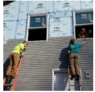
Habitat for Humanity