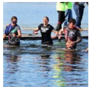
Polar Bear Jump