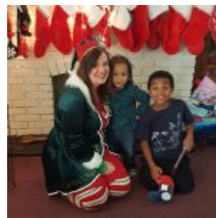
Polar Express CVSR