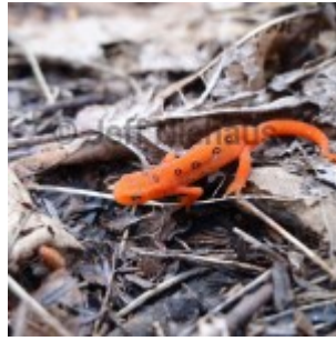
Red Eft_Red-spotted Newt, Clay County, WV