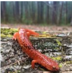
Red Salamander – Pseudotriton ruber