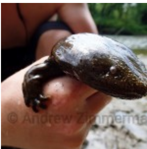
Eastern Hellbender – Cryptobranch us alleganiensi s