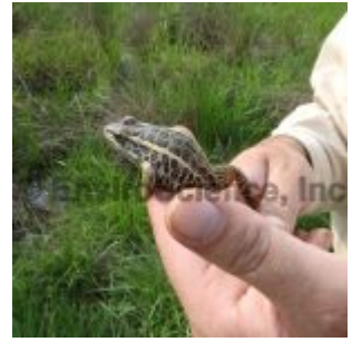
Pickerel Frog – Lithobates palustris observed during an ES wetland survey