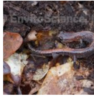
Northern Zigzag Salamander – Plethodon dorsalis