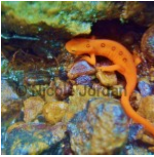
Red Eft_Red-spotted Newt ( Notophthalmus viridescens )