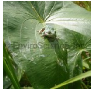
Frog spotted in a wetland at Freedom Trail, OH