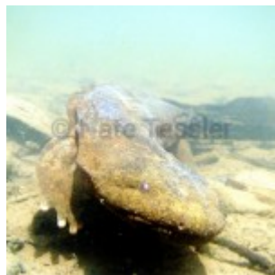
Hellbender – Cryptobranch us alleganiensi s