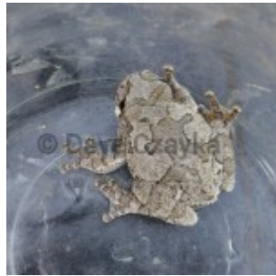
Gray Tree Frog